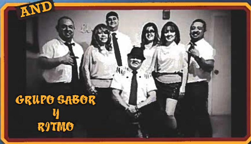
GRUPO SABOR y RITMO